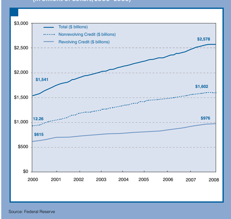
FIGURE 1. Trends in Consumers' Outstanding Credit (in billions of dollars, 2000–2008)

ers (at least homeowners) are taking on more debt as a percentage of their disposable income. Figure 2 shows trends in two key indicators of consumers' debt burden: the debt service ratio and the financial obligations ratio (DSR and FOR, respectively). The Federal Reserve defines the DSR as the percentage of disposable personal income devoted to consumers' minimum estimated debt payments for their mortgages and consumer debt. The FOR adds to the DSR numerator the estimated payments for automobile leases, rent for tenant-occupied property, homeowners' insurance, and property tax payments. By both measures, many Americans are increasingly burdened by debt.